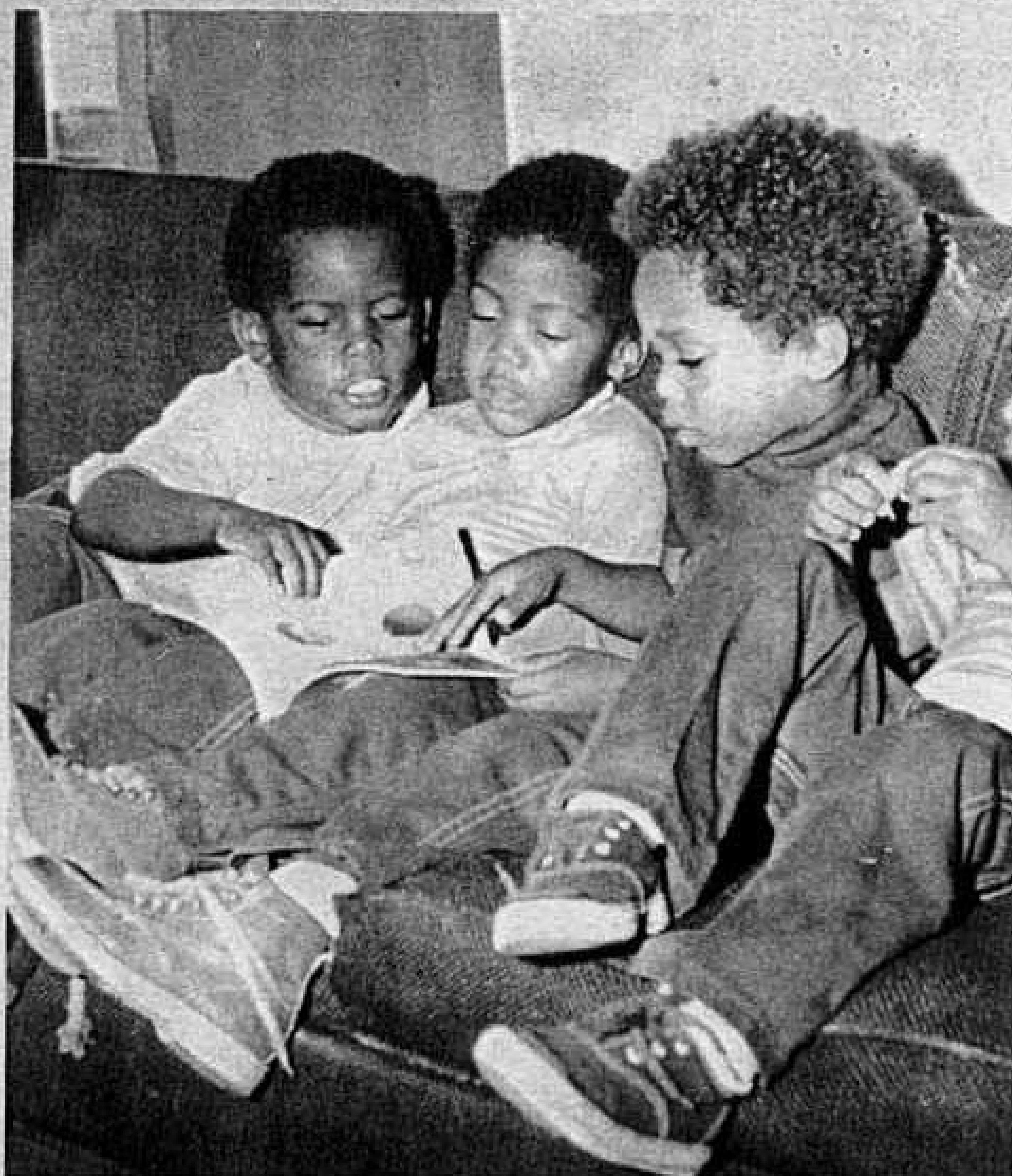
At the Institute, both the instructors and youth understand the principle "each one help one; each one teach one."

is far too small. The proposed site for the new Institute is a large church located in East Oakland. The church has 35 rooms of various sizes, including an auditorium and cafeteria which seats 350 persons. There are also 15 rooms which have already been designated as classrooms. In addition to the church there are four houses which we would like to purchase and use for living quarters for the youth. Another important factor about this location is the neighborhood — which is predominantly Black (low to middle income families). This large facility would enable us to develop our program in many ways. We would like to expand our present program to include more of the youth in the community. We have had many requests from interested parents who wish to have their children enrolled; we have a waiting list of 20. Two additional programs we would like to start are a tutorial program for youth from 11-17 and an adult literacy program.