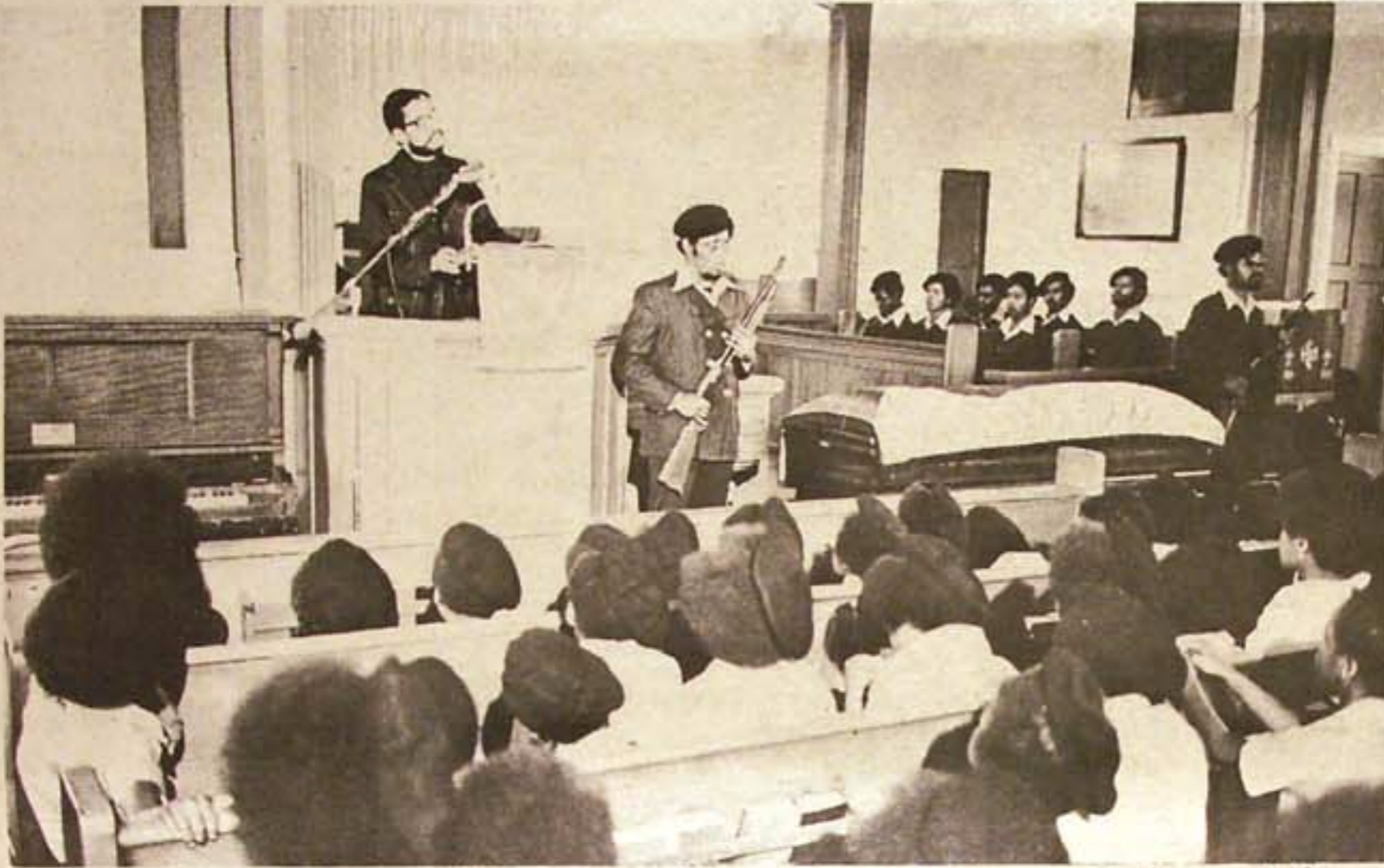
Preaching on the revolutionary practice of Comrade George Jackson, at the Memorial Service for the Field Marshal.