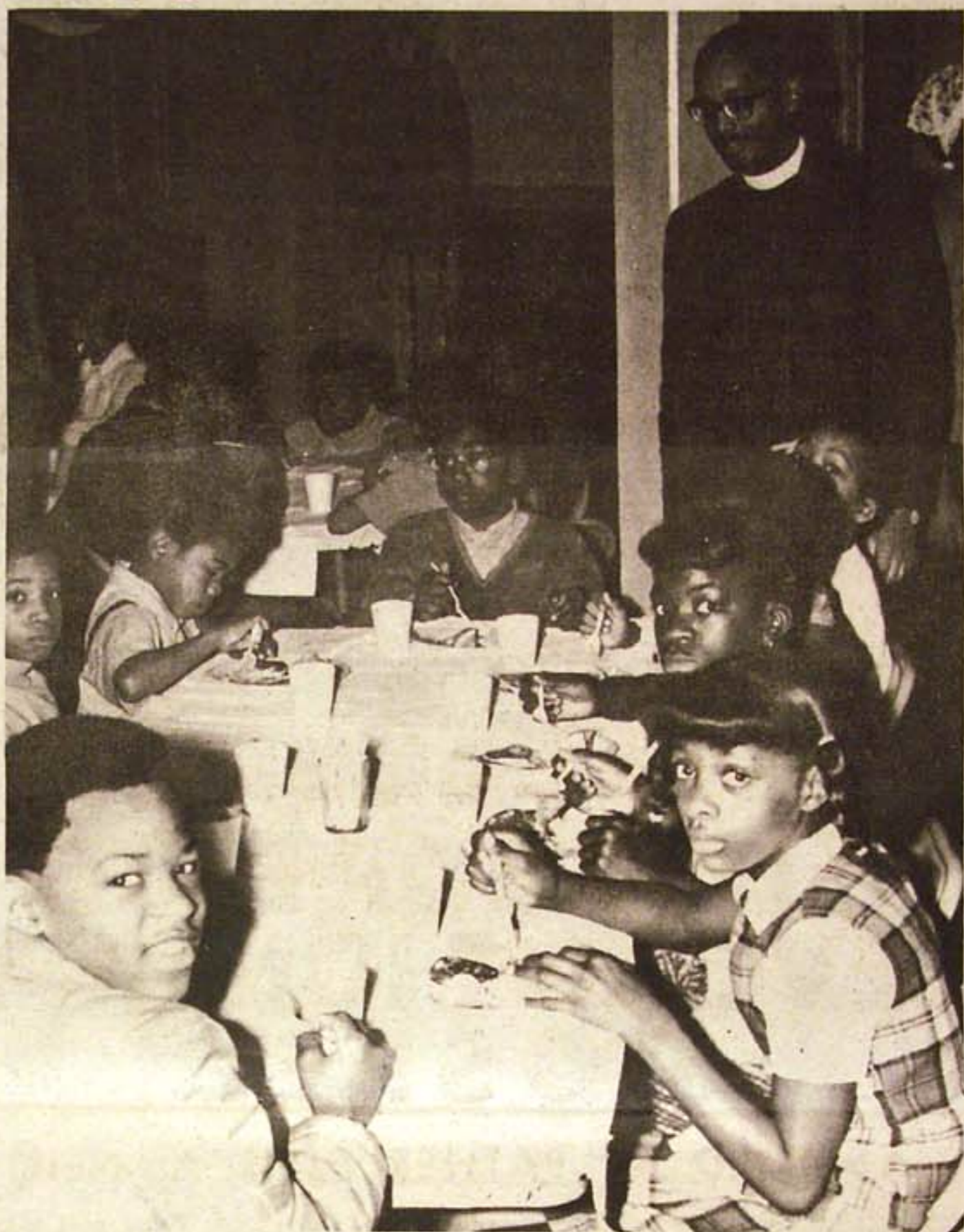
"....I believe in the way the Party has moved, and, through my observation and my own experience." (At the Black Panther Party's first Free Breakfast Program, at St. Augustine's, in 1968.)

As I suggested earlier, the mood of Blacks around the country was changing (in 1968), the response of Blacks to the racism and oppression of this country. We saw that the powers-that-be did not respond to non-violence, so Blacks were forced to take another stance. The Deacons for Defense and Justice during that time also survived. Of course, we had the street rebellions of Watts, and so forth, and Blacks were standing up and trying to find a way to respond to the oppression that they felt and lived with day by day. The Party, very simply, as I understood the Party, was saying we want to put these programs into operation; and it's been the case, historically, whenever these programs have been put into operation, the military has been sent in to stop them. The Party is saying that whenever the military is sent in, Black people will defend themselves, as we have, because we can have no defense from any other place... And, I felt that the Party was in the vanguard of this response.