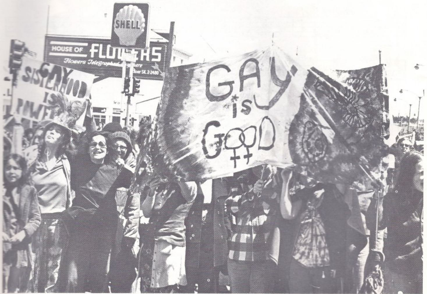
PEACE COALITION MARCH APRIL 24, 1971, SAN FRANCISCO